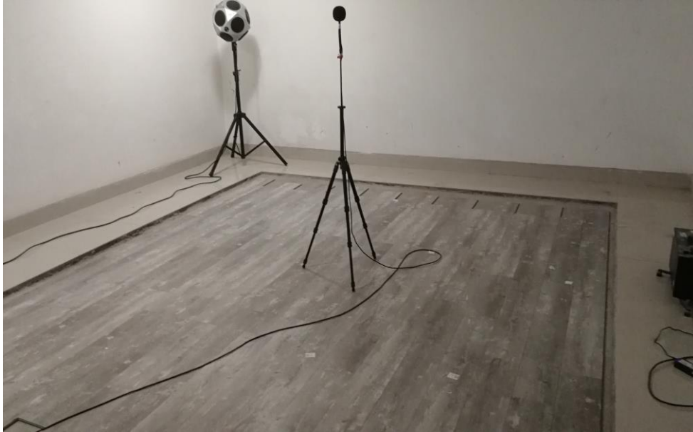
Test set up